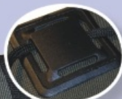
That two-way clip gives plenty of options for mounting the pouch