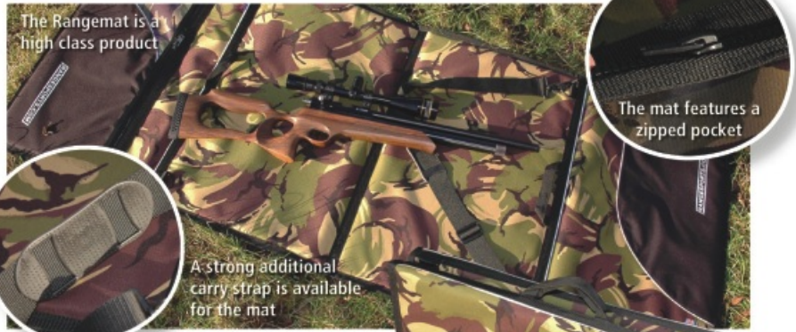
The Rangemat is a high class product