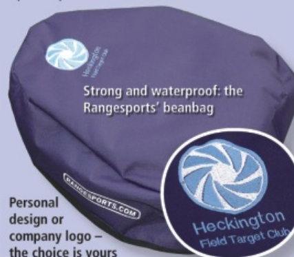
Strong and waterproof: the Rangesports' beanbag

My old beanbag (again British-made although no longer produced) is constructed from near-identical fabric. It has just completed 20 years service, so they clearly represent an investment if the quality's up to scratch! Eight colours are available, as per the pouches.