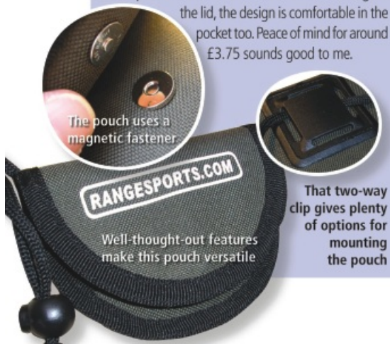
The pouch uses a magnetic fastener